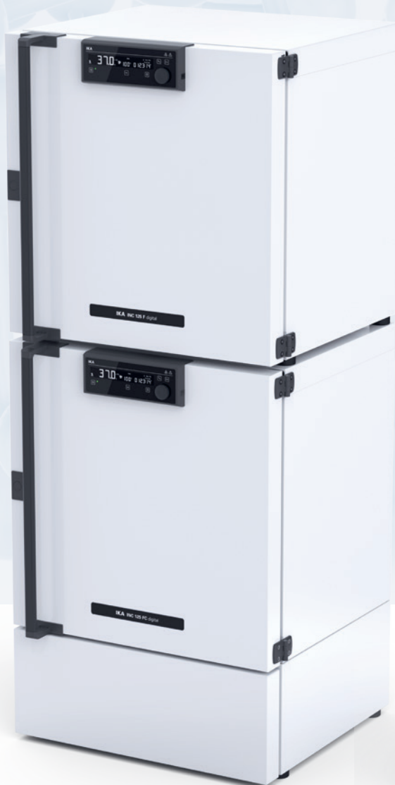
Incubator INC 125 F digital

Up to two IKA incubators can be stacked with the appropriate accessories. When stacking different types of incubators, it is recommended to place the INC 125 FS incubation shaker or INC 125 FC cooling incubator at the bottom and the INC 125 F incubator at the top. Due to its heavy weight, the INC 125 FC cooling incubator must always be placed at the bottom; it is not possible to stack two INC 125 FC cooling incubators.