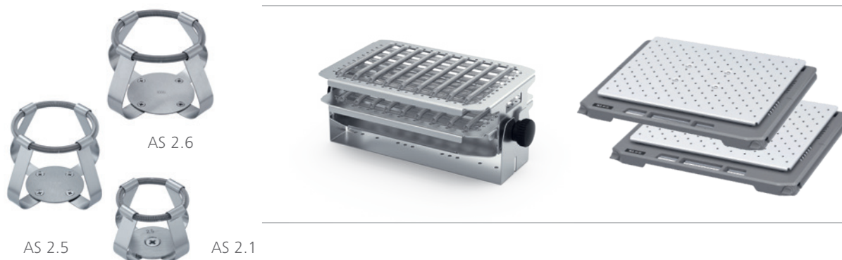
Number of usable vessels with

You can find out more about our accessories at www.ika.com .